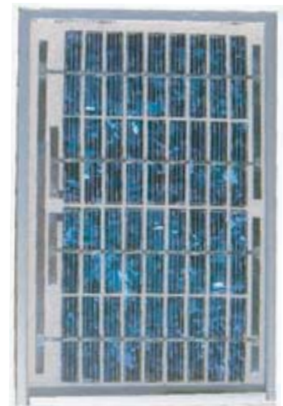
Power Up 2-7 Watt Module