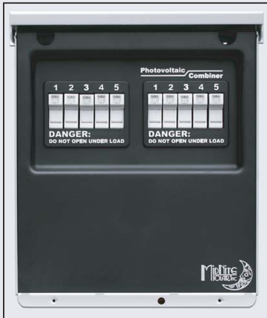
Configured for 600VDC Fuses (Gridtie)