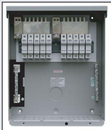
Configured for 600VDC Fuses (Gridtie)