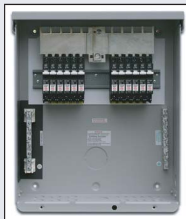
Configured for 150VDC Breakers (Offgrid)