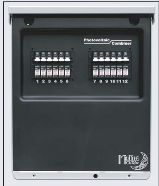
Configured for 150VDC Breakers (Offgrid)