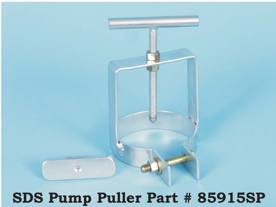
SDS Pump Puller Part # 85915SP