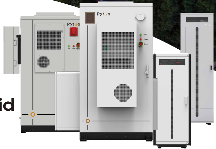
Pytes HV Series Batteries